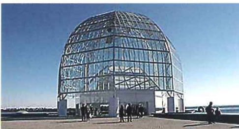
Aquarium / Aquaculture