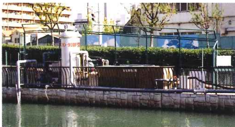
River & Lake Purification System

You know "There are interspaces in water!". Succeeded in dissolving oxygen in the interspaces into water!