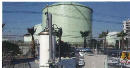
Hydrogen sulfide removal

Contribute purification of sedimentary rivers, lakes, marshes and industrial waste/pollution water by high density dissolved-oxygen!